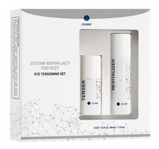
15 ml + 30 ml