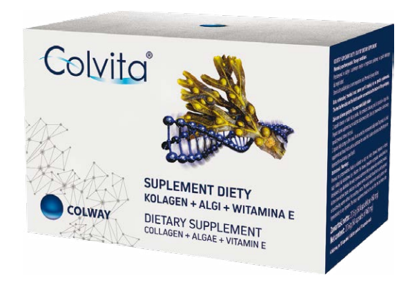
60 or 120 capsules

This is not only a dietary supplement that's unique in the world, but also a nutricosmetic. Nutricosmetics are products which nourish the skin from the inside.